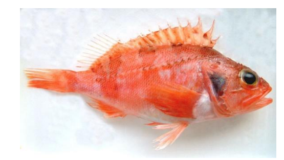
Yellow Grouper/Epinephelus awoara 5 Kg +

Black Belly Rosefish/ Helicolenus dactylopterus 500 Gr +